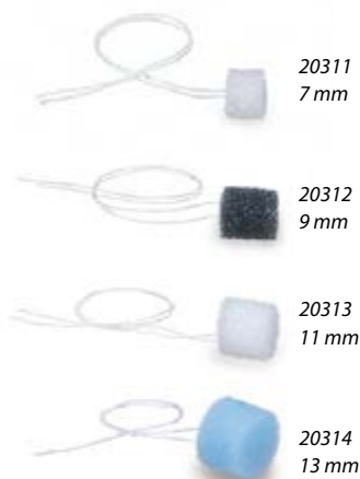
20311 7 mm