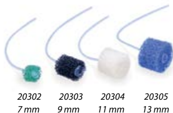
20302 7 mm 20303 9 mm 20304 11 mm 20305 13 mm