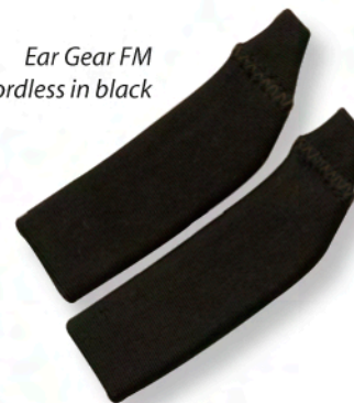
Ear Gear FM Cordless in black