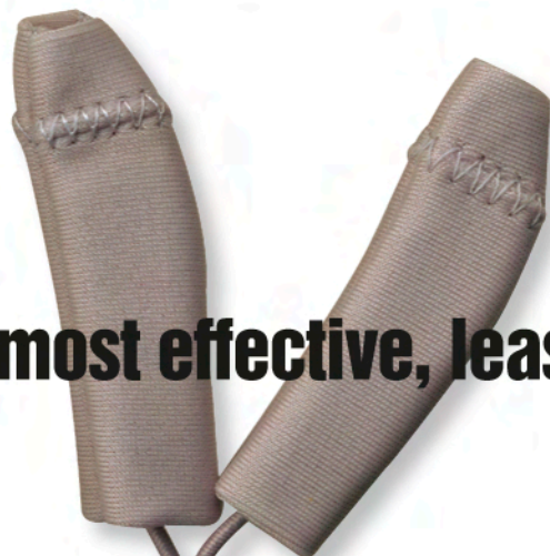
Ear Gear Original Corded with clip in gray