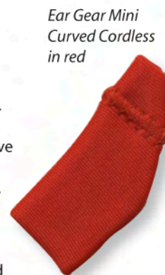
Ear Gear Mini Curved Cordless in red