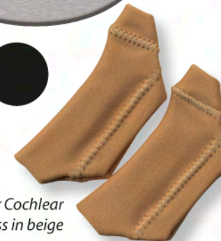
Ear Gear Cochlear Cordless in beige