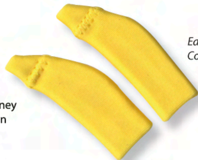
Ear Gear Original Cordless in yellow

The good news is, there is a simple and inexpensive solution.