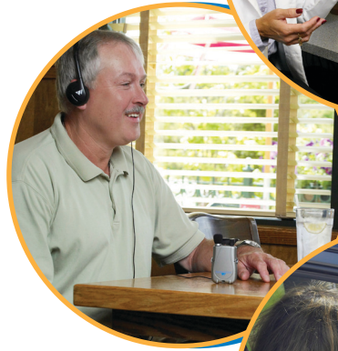
Conversation in Restaurants