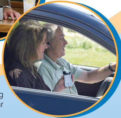
Listening in a Car